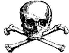
Castal Galbeau, of Tasso origin

Sir Cragswagger passed away in his home 8th of August, year of our Lady 2789. He is survived by one brother, two sisters, his wife and two sons. Lieutenant Colonel Cragswagger, Ret, had a distinguished military career spanning five decades in various capacities in Her Majesty's Armed Forces, including service in 387th Mayfly Light Foot Brigade, 211th Dragoon Flies and the now famous, HRM's 81st Dirigible Para-Calvary, as well as distinguished service in the Yoban including accepting the surrender of the Honorable Mehelevi Talhim Kuru.